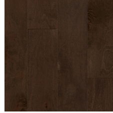
Buxton Brown 6-1/2" EMEC72L04SEE