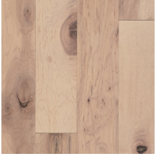
Moonlight 6-1/2" EMEC72L01SEE