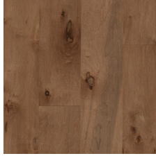
Tudor Tan 6-1/2" EMEC72L02SEE